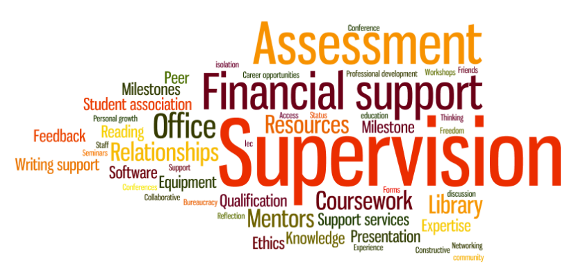
Figure 4. Word-Cloud Depicting What Postgraduates Consider to be Key Components of their Postgraduate Student Experience.

It appears that what matters most to postgraduate students are the basic components of their educational experience. For students in research-based programs, it is the quality of supervision, and for students in course-based programs, it is quality assessment. Financial support also emerged as a salient theme. When interviewed students were asked a similar question, the most frequently used word was – support. When probed, many students said they wanted more support for research and/or employability. A staff person said, 'because of the nature of being a postgraduate – their age and therefore their maturity – in terms of their readiness to engage with learning at a particular level is going to be different. And so a lot of students would say, "look, I have done all of that. I know exactly what I need. My time is very, very precious because I am looking after a family and trying to hold down a job. I am doing this for a very focused reason and it is about learning these professional skills." They are far more focused and they have got more life experience and they are more mature so I think they come to learn. They are not looking to have a social life here particularly.' In regard to good practice, universities were commended when they had efficient support services (particularly of an administrative nature) in place for postgraduate students.